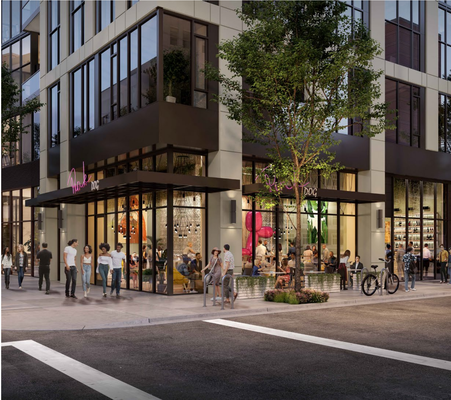
Perspective from Franklin Street and 14 th Street