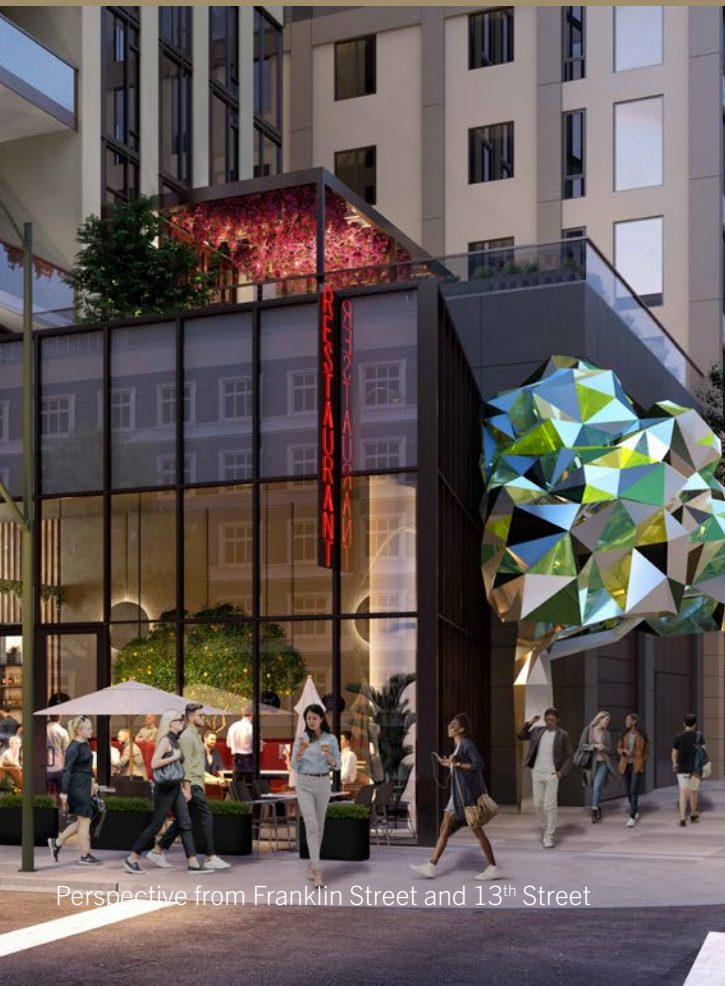
Perspective from Franklin Street and 13 th Street

Valet parking will be available for the customers visiting Atlas' restaurants and retails, extending the trade area.