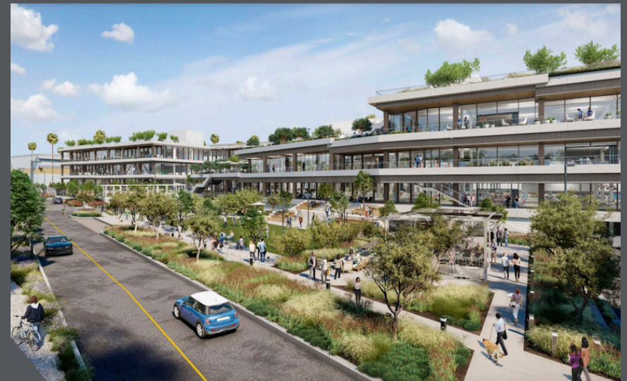
RENDERING OF THE ONE WESTSIDE CONVERSION

GOOGLE SNAGS ALL OF HUDSON-MACERICH ONE WESTSIDE CREATIVE OFFICE REDEVELOPMENT.